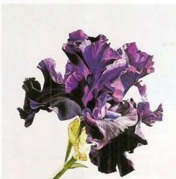
Bearded Iris , oil on box canvas, 50 x 50 inches