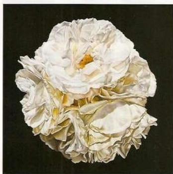
Blush , oil on box canvas, 50 x 50 inches