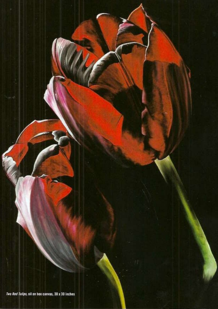
Two Red Tulips , oil on box canvas, 30 x 30 inches